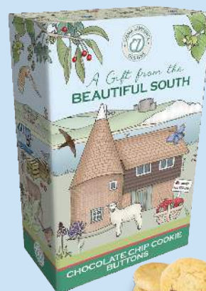
41804 FPB-8 - Chocolate Chip Cookie Buttons 12 x 130g