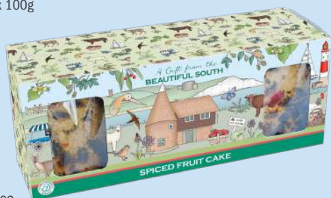
41802 FPB-7 - Spiced Fruit Cake 6s