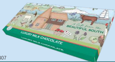
41807 FPB-3 - Milk Chocolate Bar 12 x 100g