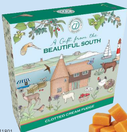
41801 FPB-2 - Clotted Cream Fudge 14 x 300g