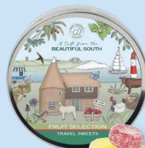
41809 Travel Tin - Fruit Selection 12 x 200g