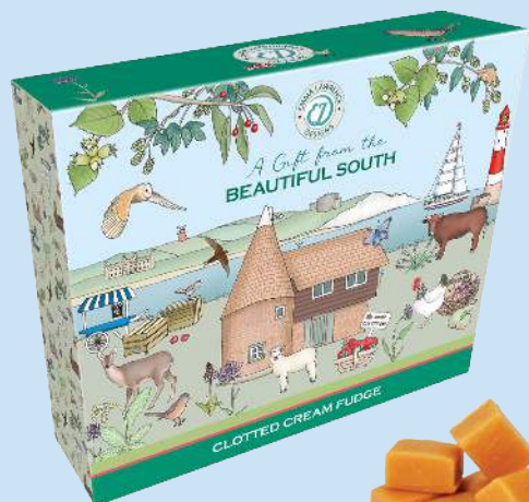
41800 FPB-1 - Clotted Cream Fudge 28 x 150g