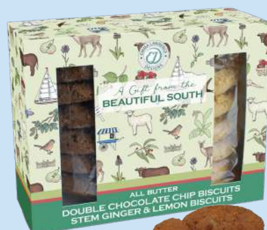
41805 FPB-9 - All Butter Double Chocolate Chip Biscuits (80g) & All Butter Stem Ginger & Lemon Biscuits (80g) 12 x 160g