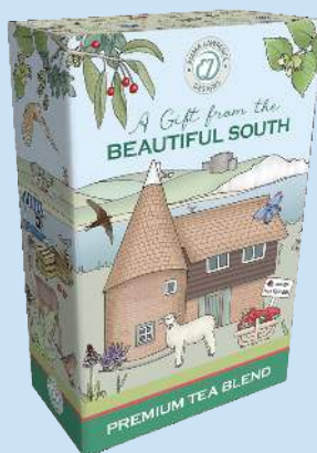
41803 FPB-8 - Premium Tea Blend 12 x 75g